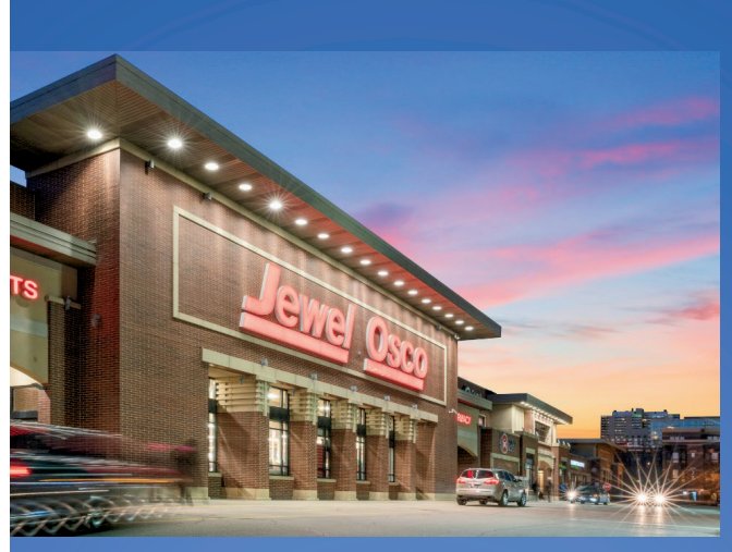
Old Town Square | Chicago, IL