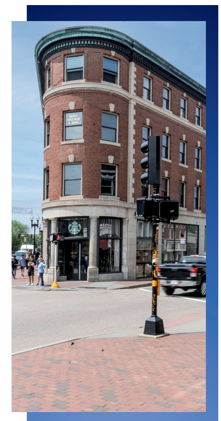
The Abbot | Cambridge, MA