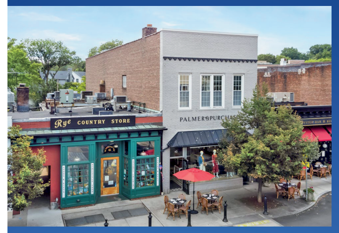
Purchase Street | Rye, NY