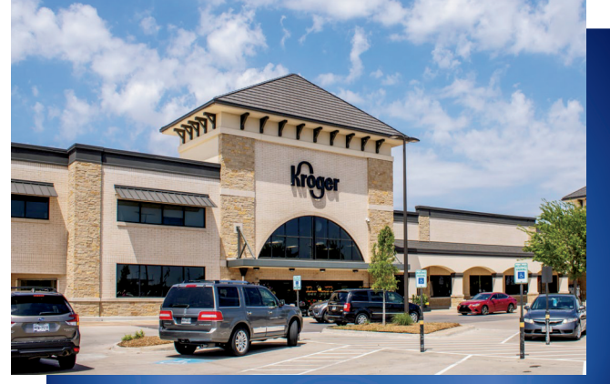
The Village at Riverstone | Sugar Land, TX

3.8% Dividend CAGR (compound annual growth rate) since 2014